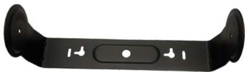
The speakers comes with a U Brackett

The plastic handle screw knob makes it a snap for installation.