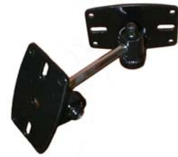
SB 35B Optional Universal Mount Bracket

The plastic handle screw knob makes it a snap for installation.