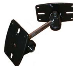
SB 35B Optional Universal Mount Bracket

The plastic handle screw knob makes it a snap for installation.