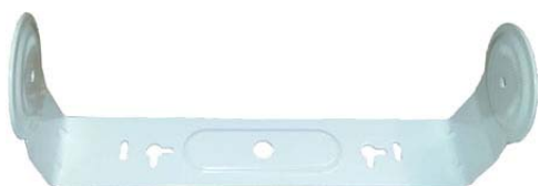
The speakers comes with a U Brackett

The plastic handle screw knob makes it a snap for installation.